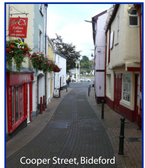
Cooper Street, Bideford