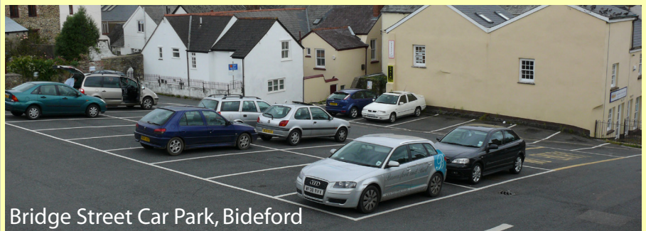
Bridge Street Car Park, Bideford

Savills have been appointed to prepare a Site Development Brief and the inception meeting was held on 6 October. The draft brief will be ready for consultation before Christmas.